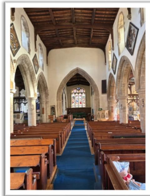
The Nave and chancel of St Andrew's

Our building is large for the population, comfortably able to seat 250 in the congregation. We have also recently appointed a development architect who is helping us imagine how to improve the building to the benefit of all.